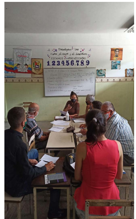
Picture caption TBD

“The experience with Brisas del Chama has been quite rich because of the interest of its inhabitants to gain knowledge and face the issues related to public services in the community. We first faced a disinterested community, and now that we have done work within the community and introduced ourselves in their dynamics, even young leaders have surged. .”